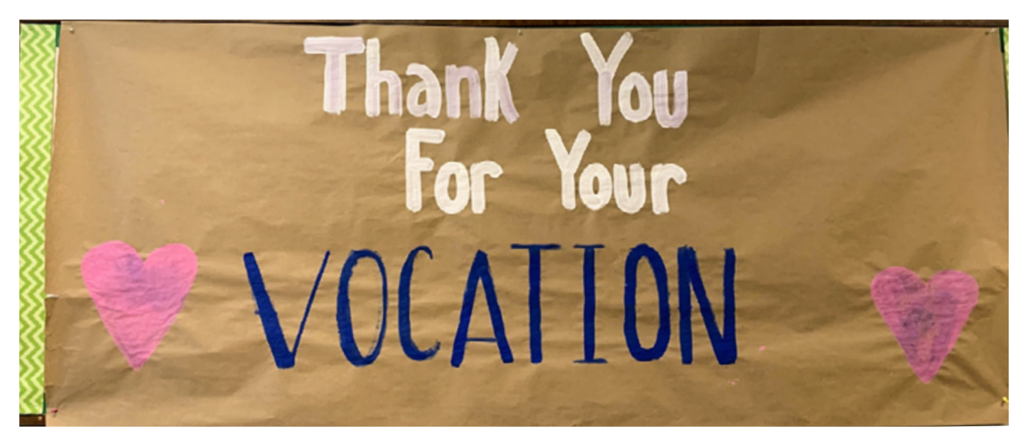
Students in the Christian Leadership class created signs thanking the members of SCS for what they do.

"I love the opportunity of receiving a Catholic education because I enjoy getting to learn more about my faith and having it be a big part of my everyday life."